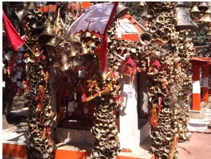
Figure 4: Brass Bells Tied as Manautis in Chittai

Aditya Malik states that Goludev's devotees seek his intervention in the matters of justice through two ways. The first way of addressing the matter is through written petition (manauti) on an official stamp paper or blank sheets together with offering of brass bells in his main temples (also known as 'courts of justice') at chittai (near Almora) and Ghoda Khal (near bhavali). And the second manner involves performing an oracular ritual known as jagar (Aditya Malik, 2009).