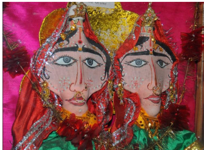
Figure 1: Nanda Devi and Sunanda Devi, GBVP Museum, Almora