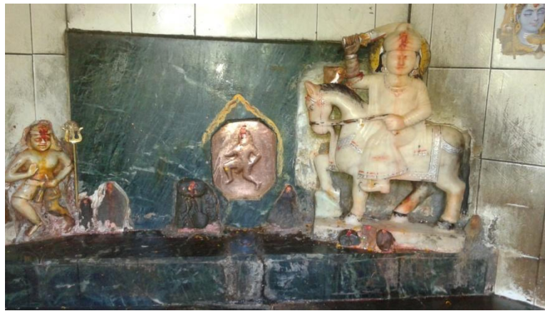
Figure 3: Golu Dev, Near Chittai, Almora