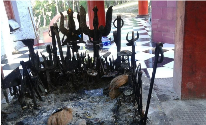
Figure 2: Nishans of Bhairava in Mukteshwar Temple, Almora