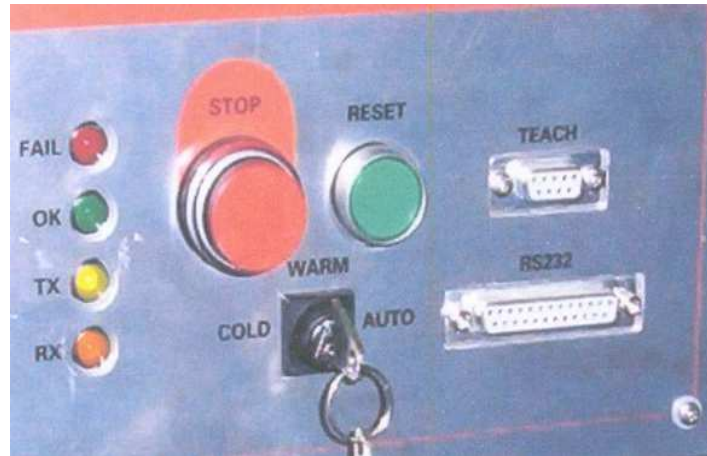
Figure 3: R-12 Robot Mk5 Controller at JNEC, Aurangabad [3]

Software is ROBOFORTH II which makes this robot really easy to get started with yet the most complex motions, interfaces and peripherals may be programmed, assisted by RobWin project manager which brings everything together on one Windows screen. Everyone who uses this system agrees it is the most flexible robot software on the planet. Commands to the controller were given through laptop/desktop computer interface using string of characters with specific programming methodology.