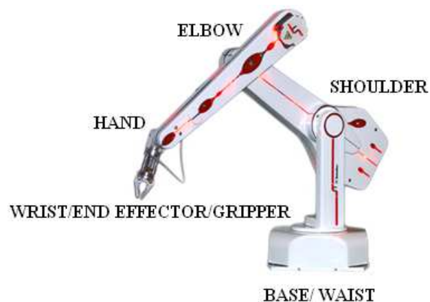
Figure 1: R-12 Robot by ST Robotics at Mechanical Engg. Dept, JNEC, Aurangabad [3]

The pictorial view of R-12 robot having five degrees of motion (i.e. five axes robot) is as shown in Figure 1.