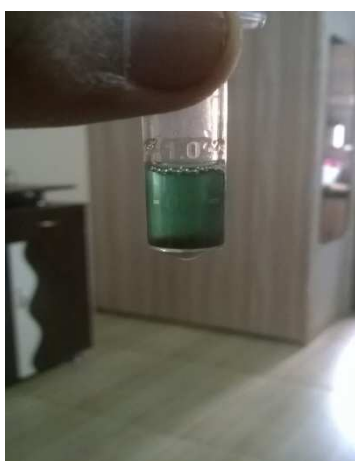
Figure 5: Formation of Precipitation after 30 mins