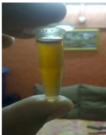
Figure 3: Holy Basil's Leaves Extract