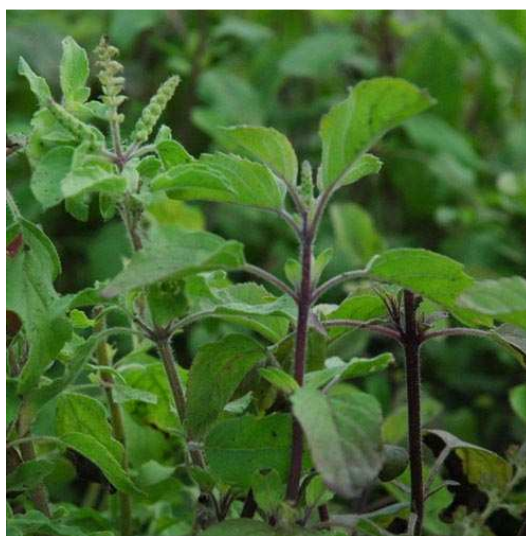
Figure 2: Holy Basil ( Ocimum tenuiflorum )

Dioxygen is used in cellular respiration and many major classes of organic molecules in living organisms contain oxygen, such as proteins, nucleic acids, carbohydrates, and fats, as do the major constituent inorganic compounds of animal shells, teeth, and bone. Most of the mass of living organisms is oxygen as a component of water, the major constituent of lifeforms. Conversely, oxygen is continuously replenished by photosynthesis, which uses the energy of sunlight to produce oxygen from water and carbon dioxide. Oxygen is too chemically reactive to remain a free element in air without being continuously replenished by the photosynthetic action of living organism. Plants need oxygen to survive but the difference is in day time they use carbon dioxide and sunlight for the photosynthesis process and emit oxygen out but in the night time due to absence of sunlight plants take oxygen and give out carbon dioxide. [4]