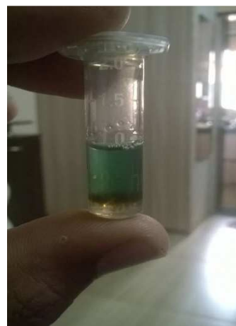
Figure 6: Rising of Pellet after Addition of Crystal