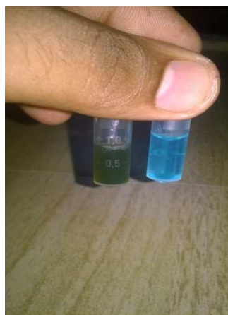
Figure 4: Green Solution and \text{CuSO}_4